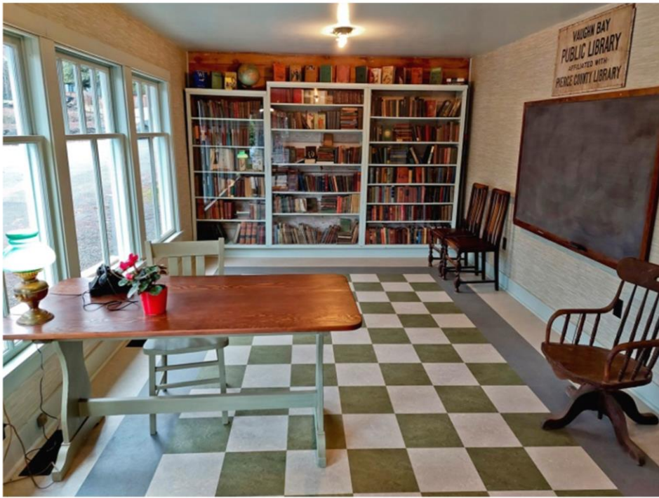
Many books still have the VBPLA stamp!

The Library: Is done!! Here's what it looks like; come by to see it in person!!