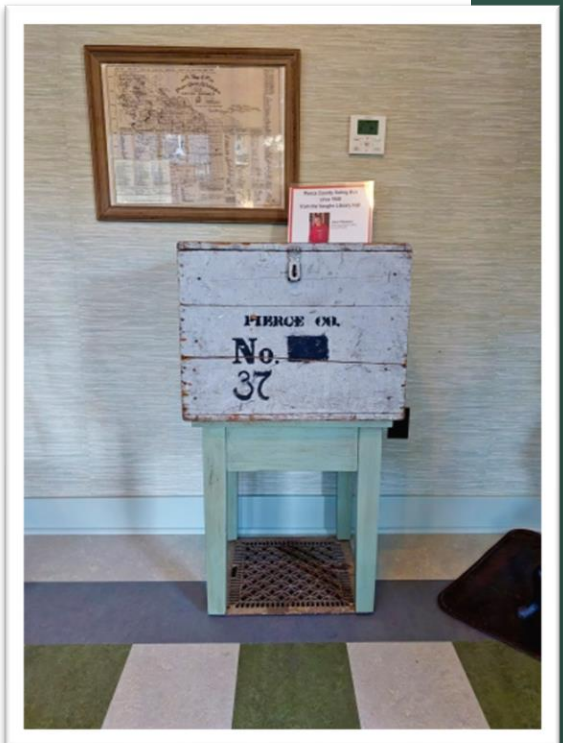
The Vaughn community voted here!

What's left: The following all need to be completed to get our building permit signed off: