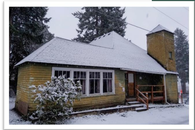
Vaughn Library Hall, January 2018

Make no mistake, it will be costly to restore the hall. But we have a great team, who know how to stretch dollars as far as possible, and they’re ready to get started. We’re very aware that construction costs will be rising next spring so now would be a great time to start. Please help by giving what you can now. The Vaughn Library Hall needs to be preserved not just for us but for future generations. Many, many thanks to all those who help us do this!